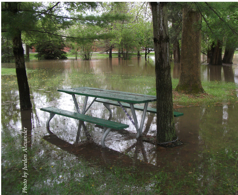
Flooded Community Space at Titus Towers, City of Ithaca

PARTNERS. Adaptation will largely be driven by agencies in the areas of planning, public works, health, and emergency response. To advance adaptation, in part through mitigation, it is essential that each local municipal partner is involved. One of the critical partners to communicate concerns and coordinate actions will be the Tompkins County Council of Governments (TCCOG). Due to the multi-disciplinary nature of adaptation it is further important to work closely with the Tompkins County Climate Protection Initiative (TCCPI), the Tompkins County Emergency Planning Committee, the County Health Department and local climate scientists.