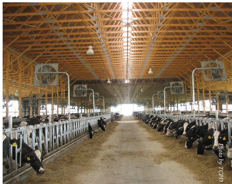
Dryden Dairy Barn

The Hazard Mitigation Plan profiled each of the hazards for which Tompkins County jurisdictions are at risk: 22 types of hazards affect the region. The plan defined each of these hazards, examined their historical occurrence, historic cost and damage estimates, as well as future potential impacts based on the latest available climate data. The existing hazards occurring throughout the county that could be affected by climate change are: severe storm, flash flood, ice storm, severe winter