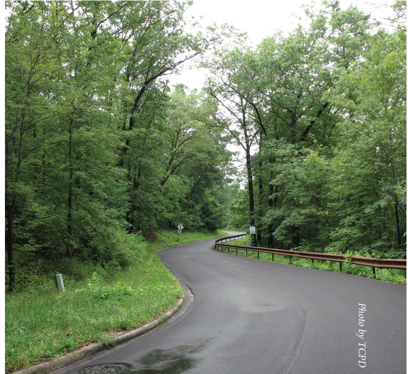
Winding Road, Tompkins County

While commute trips are important, they only represent a portion of the total daily trips taken. For all trips, privately owned vehicle trips still represent the most common method of getting around, with walking and carpooling showing strong numbers in trips having to do with family, personal, social, and recreational outings.