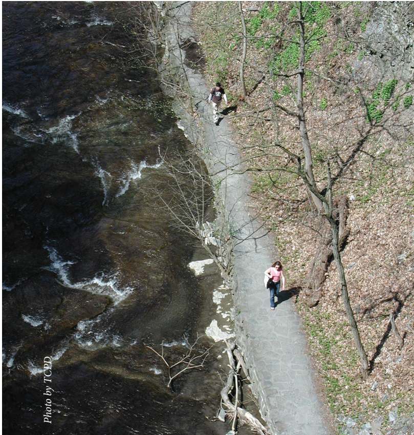
Commuting on Cascadilla Gorge Trail

egy completed in 2014, found targeted trail development in the next two to five years could create a cohesive network to form the basis of an impressive destination-quality trail system and local recreation and transportation resource.