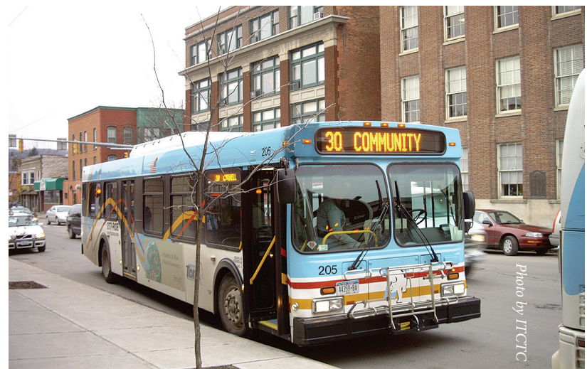
Tompkins Consolidated Area Transit in Operation

is a significant household expense and using different methods of travel can result in substantial savings. Bicycling and walking offer healthy options to move around, particularly in urbanized areas where distances between destinations are shorter. While the public transit system currently faces constraints in its ability to expand, it is clear community demand is exceeding capacity. A way to