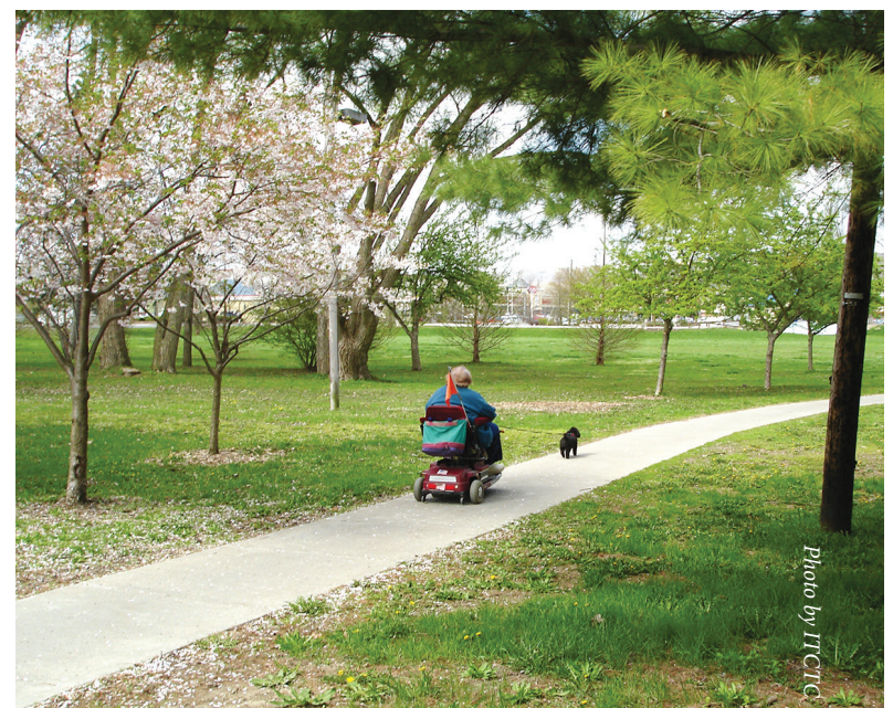
Accessing the Park, Titus Flats