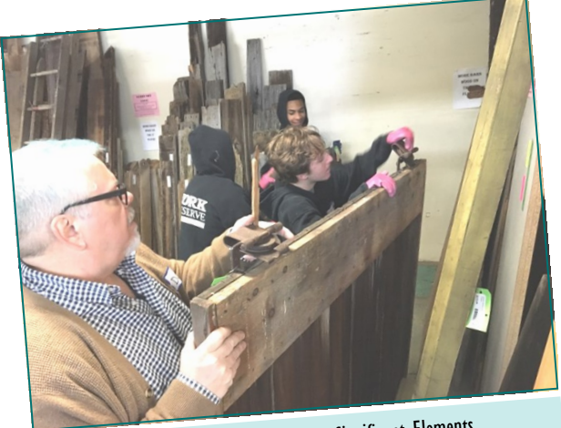
↑ YES teens preparing items for sale at Significant Elements