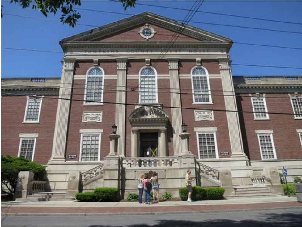
Tompkins County court house, N.Y.

Because the court records are now accessible through a Web portal, Tompkins County prosecutors and judges can access them while they're in court or about to head in for a hearing. It's a faster, simpler way of getting everything from divorce records to prior arrest records instantly, which is helpful when the defense throws a curve ball.