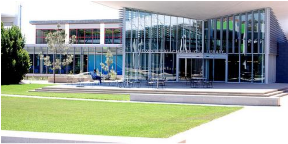
Public library and city hall complex, Newport Beach, Calif.