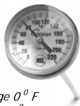
Range 0° F to 220° F