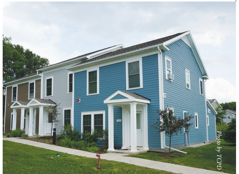
Holly Creek Townhomes, Town of Ithaca

In total, 38 percent of Tompkins County households who rent or own homes have housing affordability problems.