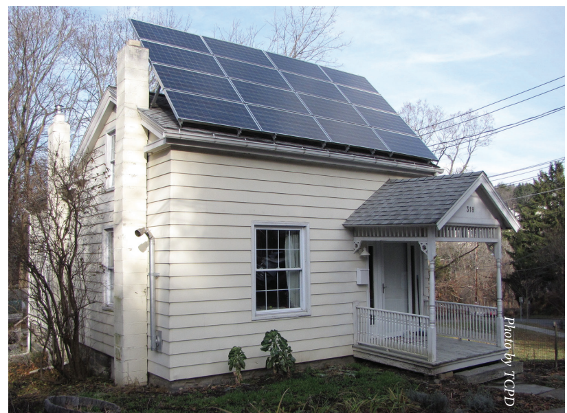
Older home with solar panels, City of Ithaca

Residential energy efficiency is critical both to the affordability of housing units and efforts to reduce fossil fuel consumption and greenhouse gas emissions. The residential sector is the second highest energy consumer and greenhouse gas emitter in Tompkins County, after transportation. High energy costs impact the ability of households to afford their homes and reduce the amount of money available for