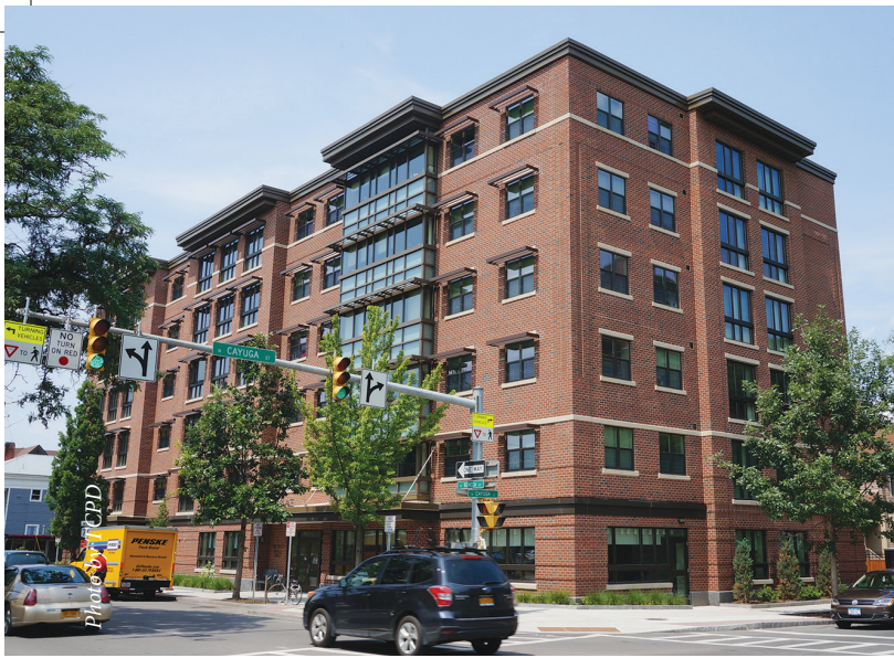
Breckenridge Place Apartments, City of Ithaca

affordable to a wide range of incomes. Universal design features enable people to live independently in their homes as long as possible and to visit others and maintain social connections. These units should be built in Development Focus Areas to ensure that seniors have opportunities for better transportation options and to more fully engage in their community.