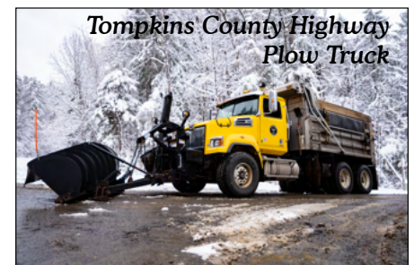
Tompkins County Highway Plow Truck

When preparing a photo for print, consider a description of the photo in the style shown here. If a photo is small, consider a thin black outline so the photo does not seem to be "floating" on the page.