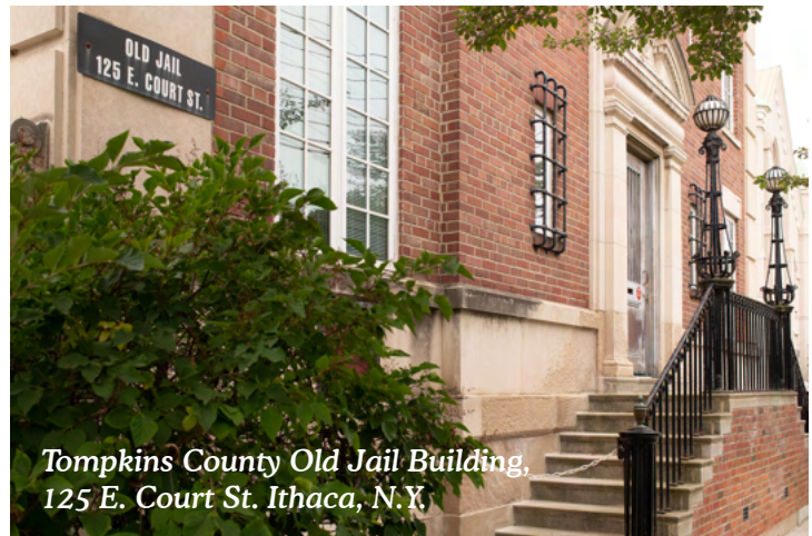
Tompkins County Old Jail Building, 125 E. Court St. Ithaca, N.Y.