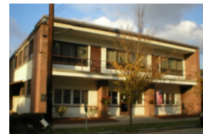
Only true county-wide assessing unit in New York State. Consolidated in 1970

The Assessment Department invites you to contact the office to verify your property information on file and make sure that it is correct. The assessment staff will be happy to correct any discrepancies that exist.